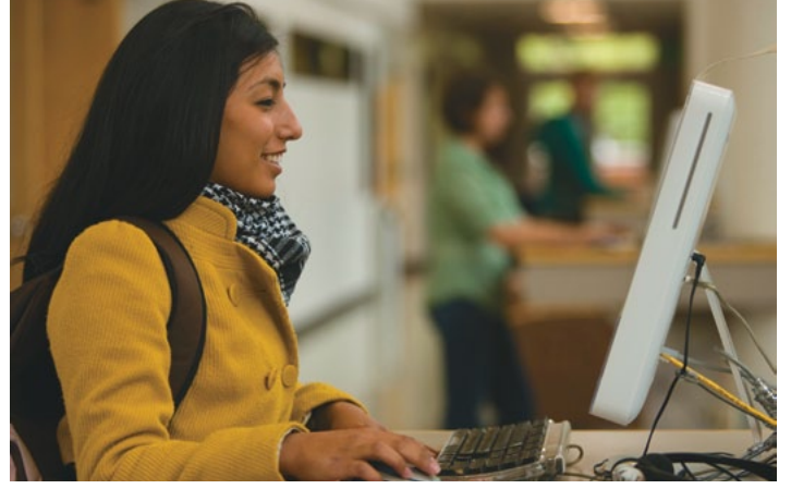
Students who want to learn more about digital writing tools have a variety of Writing classes from which to choose.

Professor Boyle's class is just the beginning of introduction to new tools. Other digital classes study certain tools or me-